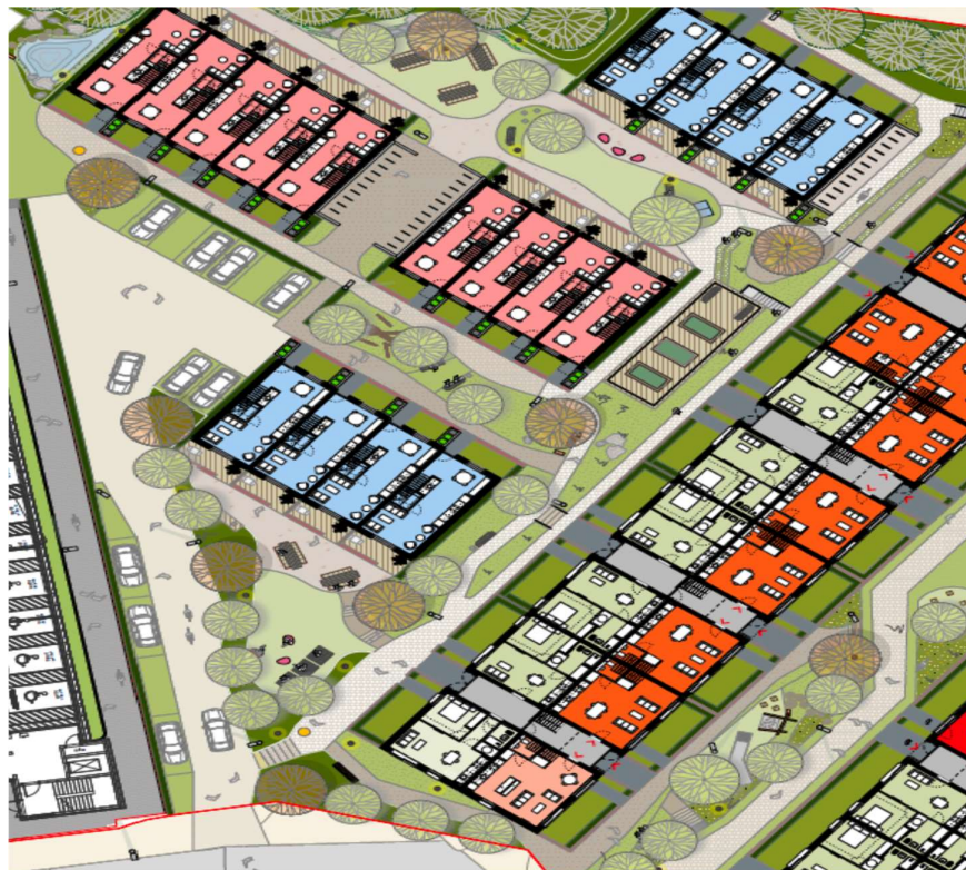
Aspire Residential Development