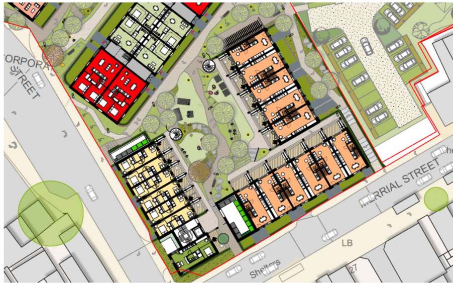
Aparthotel and apartment layout along Merriel St

commence in the summer of 2025 and be complete by late 2026. The remainder of the site works will follow on accordingly.